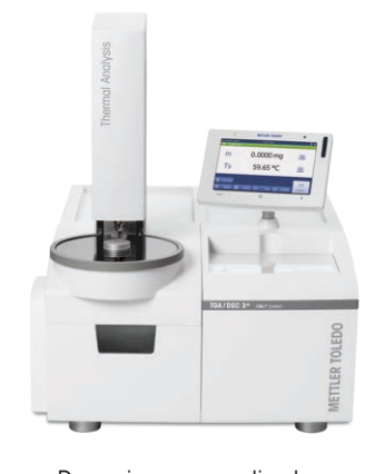
Dynamic vapor sorption by TGA Sorption Analyzer System