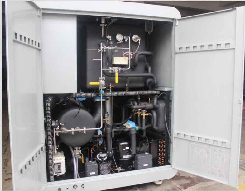
Open Type Structure: